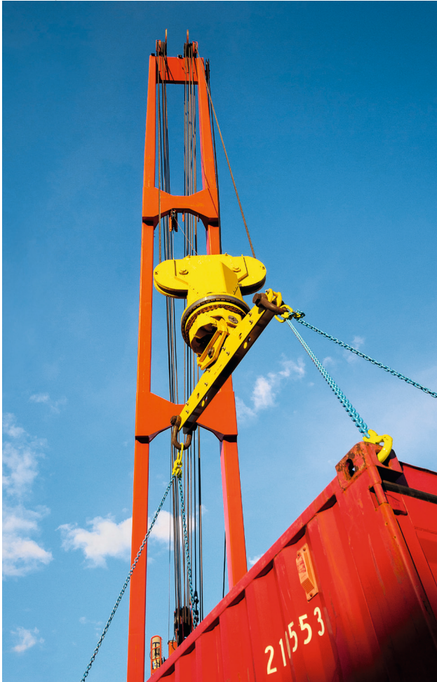
Electric power swivel with ARC