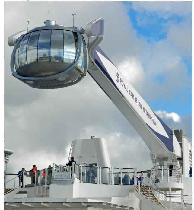
MacGregors North Star

Modern cranes complying with international standards and regulations.