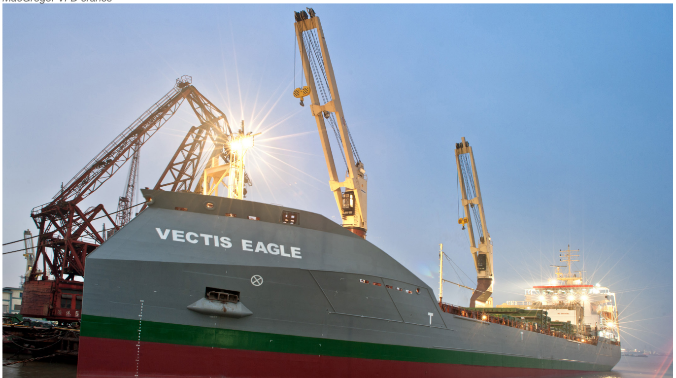
MacGregor VFD cranes